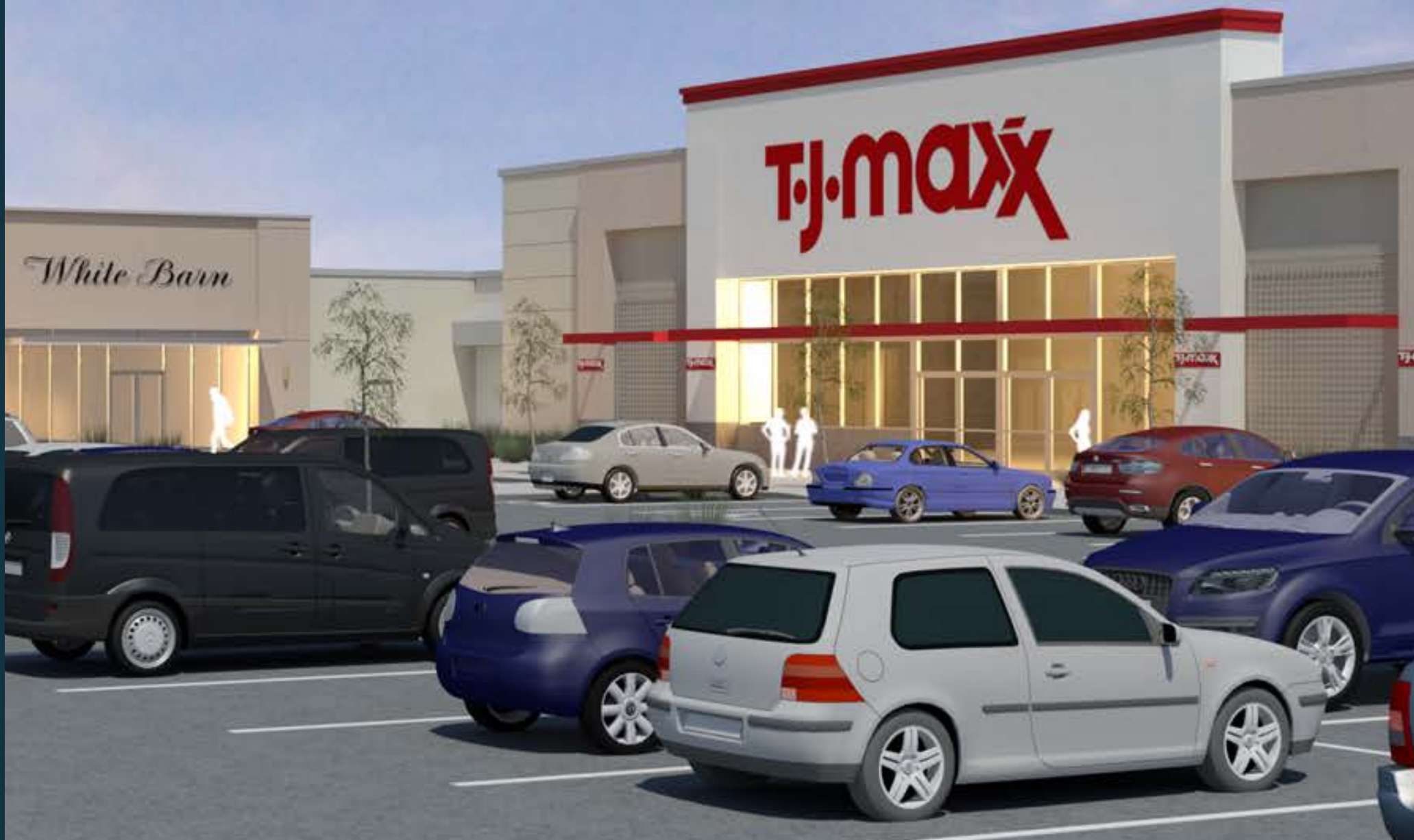
Willamette Town Center 831 LANCASTER DR NE, SALEM, OR 97301